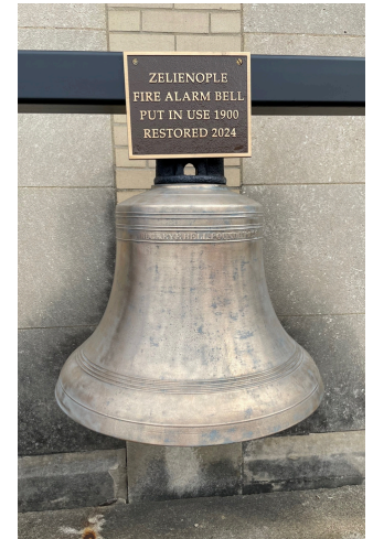
After the Restoration