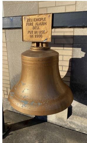
Before the Restoration